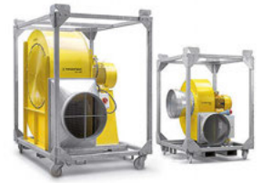
Radial fans of the TFV series High-pressure aeration and deaeration, also for Ex zones, stationary or mobile