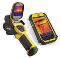
Thermal imaging cameras The IC series and the AC080V tablet PC for real-time measurements