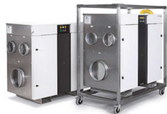
Stationary and mobile version of desiccant dehumidifier TTR 2800

Many dehumidifiers are also available with stainless steel housing and moreover offer manifold options for energy recovery ensuring maximum efficiency.