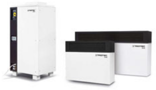
Industrial dryers of the DH series Condensation dryers, for stationary application