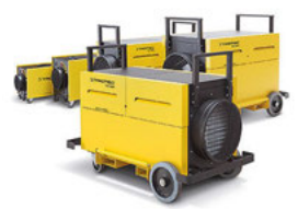
Air cleaners of the TAC series incl. cleanroom suitability, for mobile application