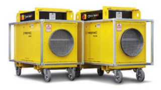
Heating units of the TEH series High-performance electric heaters, for mobile application