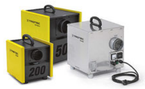
Dehumidifiers of the TTR series Desiccant dehumidifiers, for mobile application