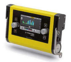
LD6000 Combination detector for acoustic leak detection and trace gas leak detection

Trotec solutions for Condition Control and Condition Monitoring