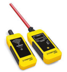
Ultrasound measuring instrument SL800R Leak detection in compressed-air lines or tanks and wear test