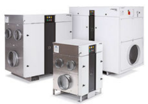
Desiccant dehumidifiers of the TTR series Desiccant dehumidifiers, for stationary application

OUR PASSION: THE PERFECT CLIMATE FOR YOUR PRODUCTION