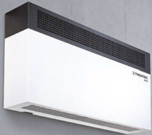
Refrigerant dryer DH 60